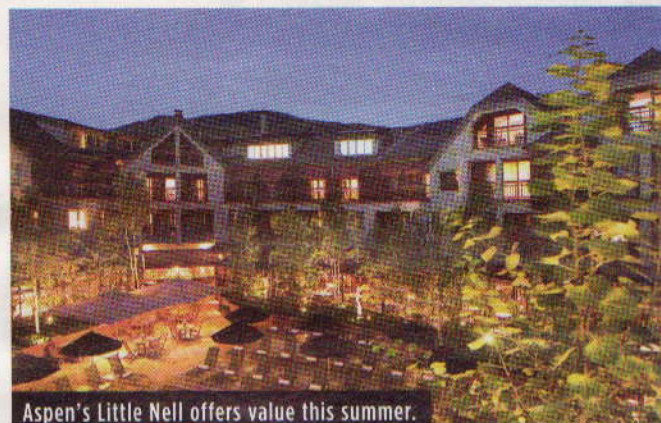
Aspen's Little Nell offers value this summer.