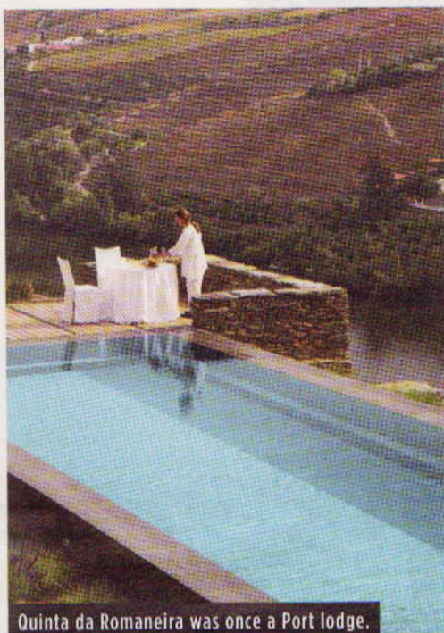
Quinta da Romaneira was once a Port lodge.

At the pinnacle of luxury is Quinta da Romaneira ( www.quintadaromaneira.pt ), which occupies an exquisitely refurbished former Port lodge on a vertiginous vineyard slope overlooking the Douro. Meals can be taken al-fresco almost anywhere on the 1,000-acre property, which also offers a pool