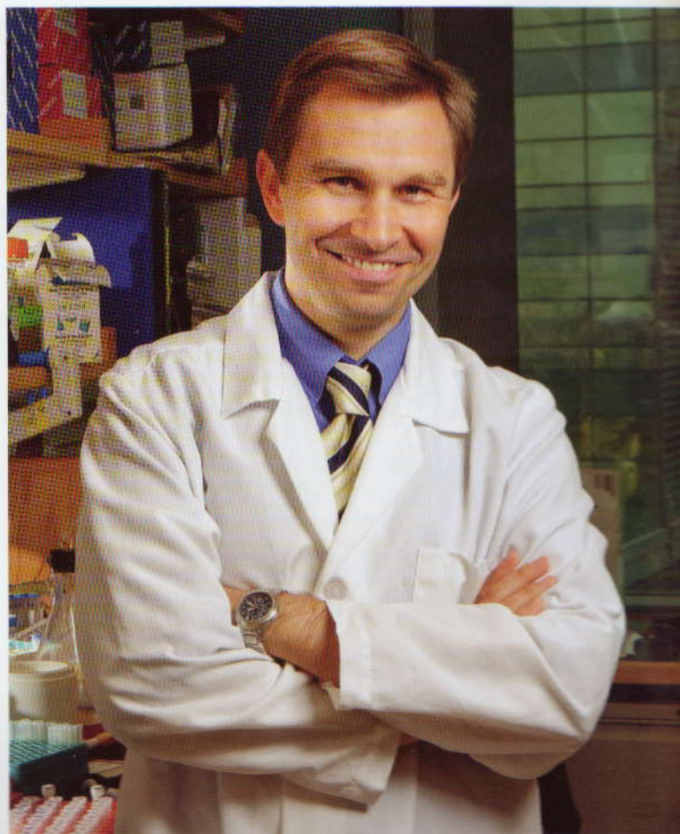
David Sinclair, Ph.D., Harvard Medical School